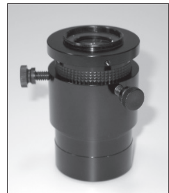
Radian locked in place