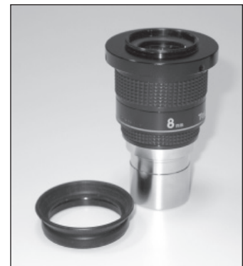
Filter Adapter Ring in place of eyeguard